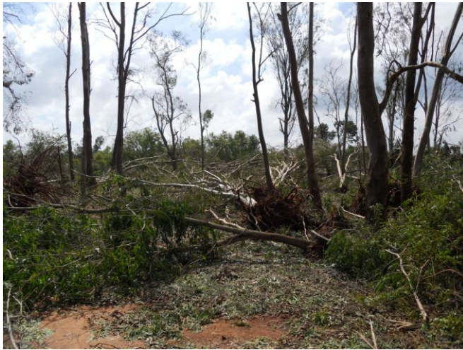
The Eucalyptus Grove

On December 31st, the work of clearing the main roads and making an inventory of the damage started. The sound of chainsaws could be heard all Auroville. Many Auroville youngsters and others were seen clearing main roads and pathways. Chainsaws being in short supply, residents were seen using ordinary saws and cutties, trying to clear the entrances and internal pathways of their communities. Certitude was heavily hit, with most of the Eucalyptus trees that line the entrance road having fallen over. The well-known Eucalyptus Grove, opposite the turn to Samasti, no longer exists. Some of the