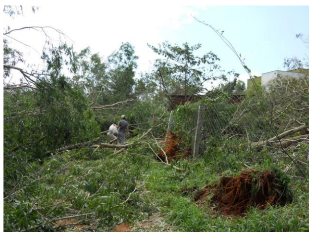
The road near Arati.

While the Matrimandir itself was not damaged, some branches of the Banyan Tree were broken off and in the Matrimandir gardens and around it, many trees fell down. Similarly, the gardens of Savitri Bhavan, the Visitor's Centre and Bharat Nivas suffered heavily, though there was no damage to the buildings. In the Sadhana Forest and Sve Dam communities, all the keet houses were fully destroyed.